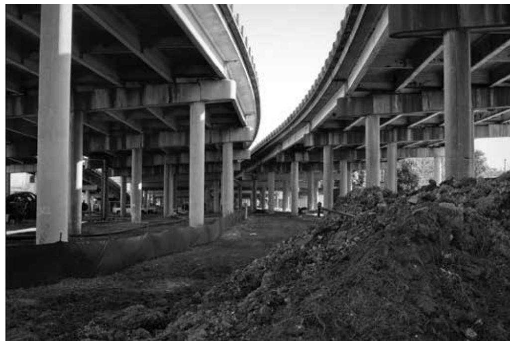
Celestia Morgan | Neighbor's House , 2019.51 | Interstate 20/59 #1 , 2019.61, © Celestia Morgan

Norwood , from the series REDLINE , 2017, archival pigment print, sheet: 16 × 20 in. (40.6 × 50.8 cm), image: 10 ⅝ × 16 in. (27 × 40.6 cm), Museum purchase with funds provided by the Sperling Family Charitable Foundation in memory of David and Natalie Sperling, 2019.59