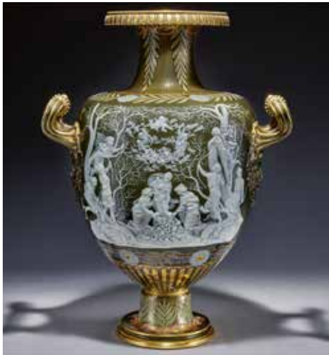
Chocolate Pot , AFI.22.2019a-b Vase , 2019.67

Modeled by Alan Best (American, 1910–2001), Wedgwood (England, est. 1759), Mandarin Duck , About 1935, solid celadon-colored earthenware, 4 × 8 ½ × 3 ½ in. (10.2 × 21.6 × 8.9 cm), Museum purchase with funds provided by Dr. Charles W. Neville, Jr., by exchange, 2019.32