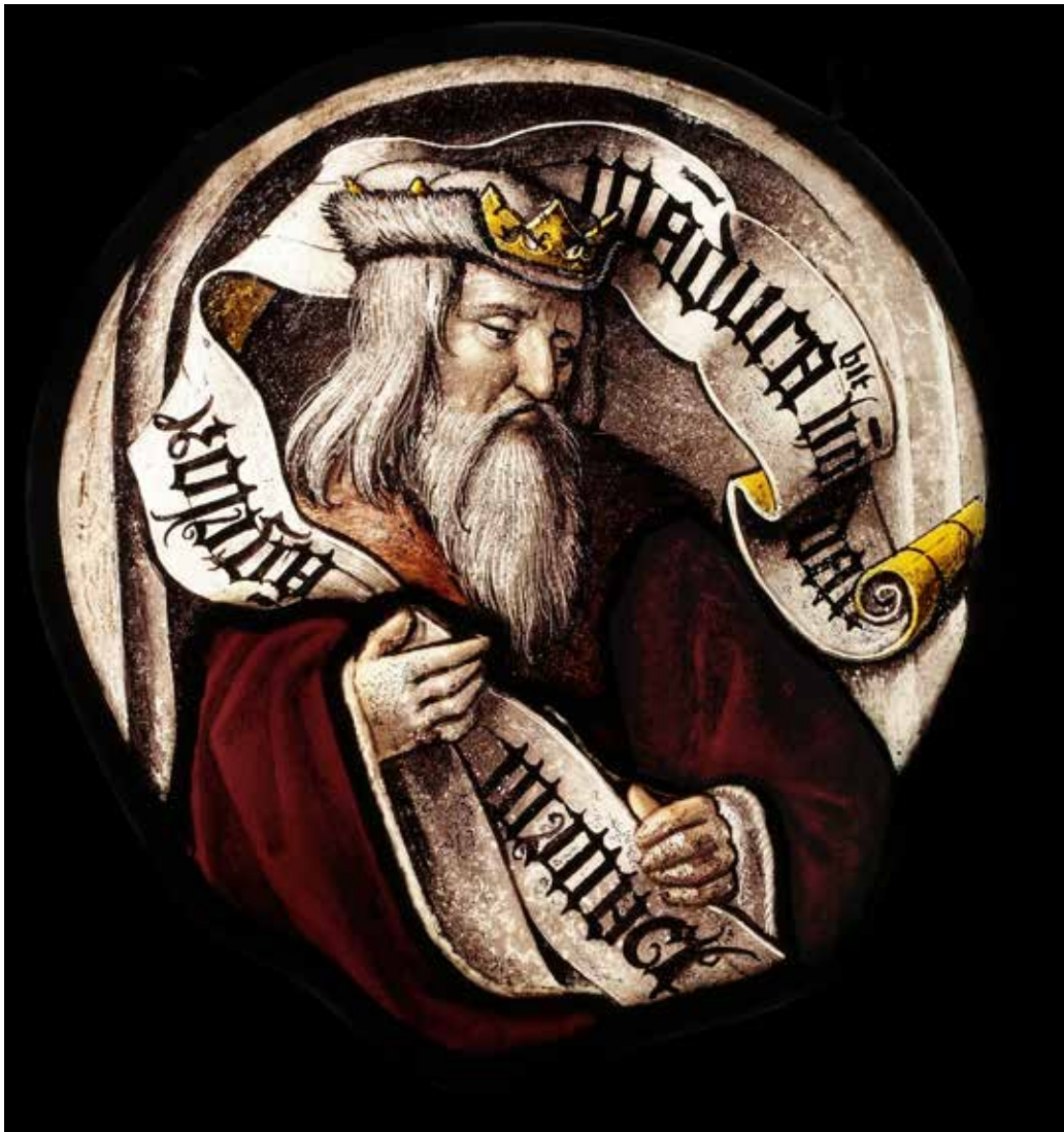
King David , AFI.23.2019

Coalport Porcelain Works (England, Coalport (Shropshire), est. 1795), Leaf-form Scent Bottle , about 1800, soft-paste porcelain with enamel decoration and gilding, 3 ¾ × 2 × 1 in. (9.5 × 5.1 × 2.5 cm), Gift of the Starr and Wolfe Family, 2019.71